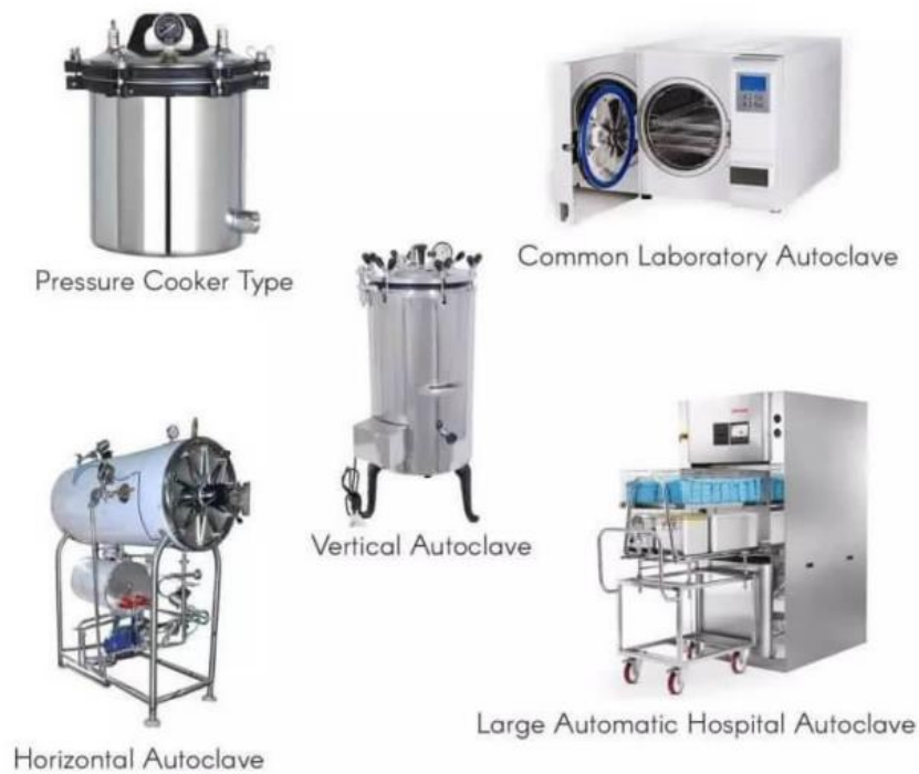
Figure 3 Types of Autoclave