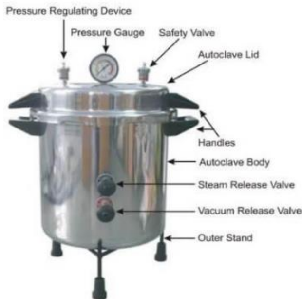
Figure 1 Autoclave Parts